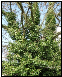
a tree choked by English ivy

Dangers of English Ivy. Ivy in the upper canopy can block sunlight and cause lower branches to die off. It competes for nutrients, and holds moisture that can also attract mosquitos. It can add significant weight and contribute to the loss of otherwise healthy trees.